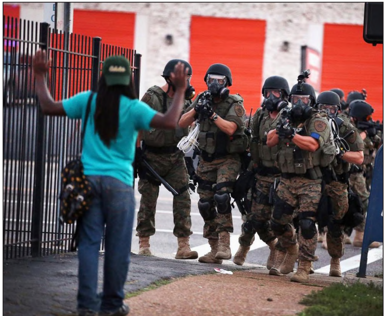
Militarized police in Ferguson, Mo., after the August 2014 shooting death of Michael Brown.

The Libertarian Party also denounces and demands